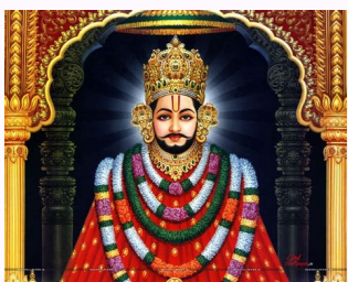
Hd images shyam baba khatu wale. Shyam baba images full hd download. Khatu shyam baba images full hd. Khatu shyam baba images hd. Shyam baba images hd download. Khatu shyam baba images hd download. Shyam baba images full hd.