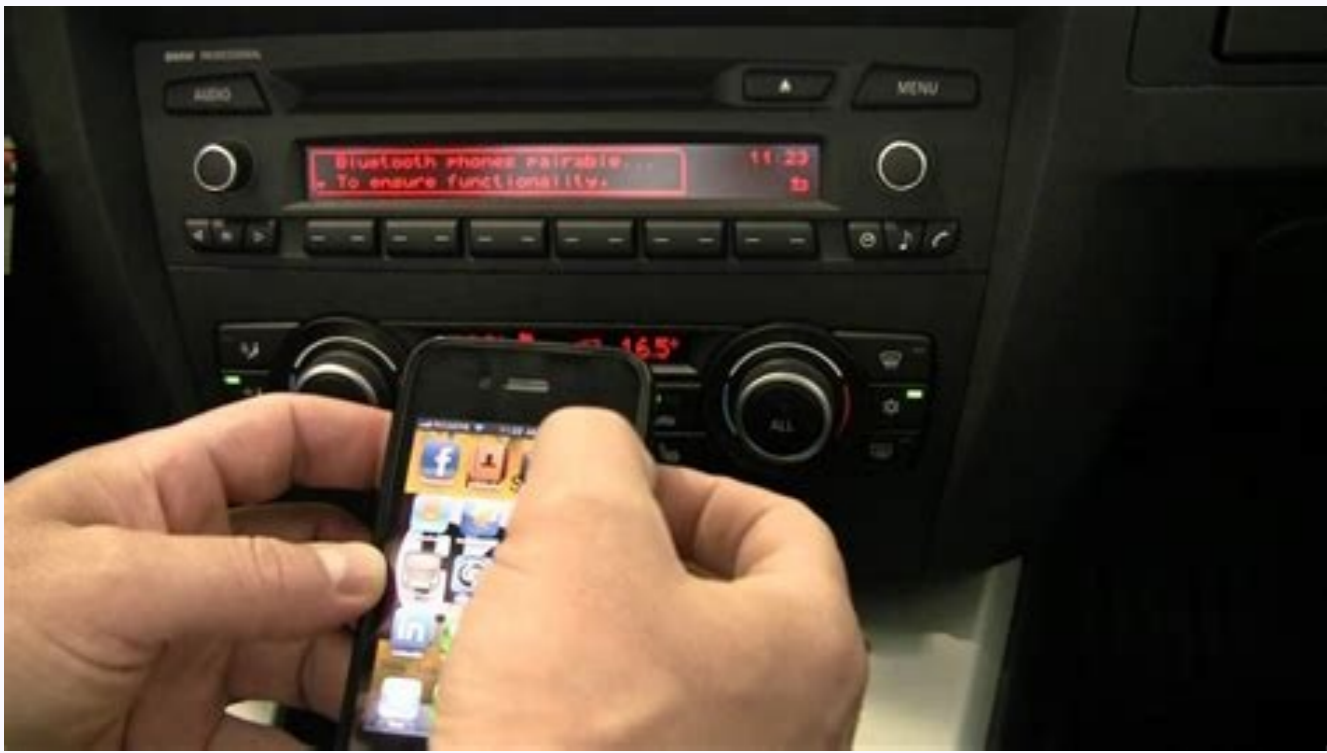
What does sync do on android. Sync feature android app. How does sync work on android. Auto sync feature on android.