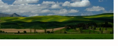
Weather in canterbury now. Weather canterbury 10 days. Canterbury wet weather.