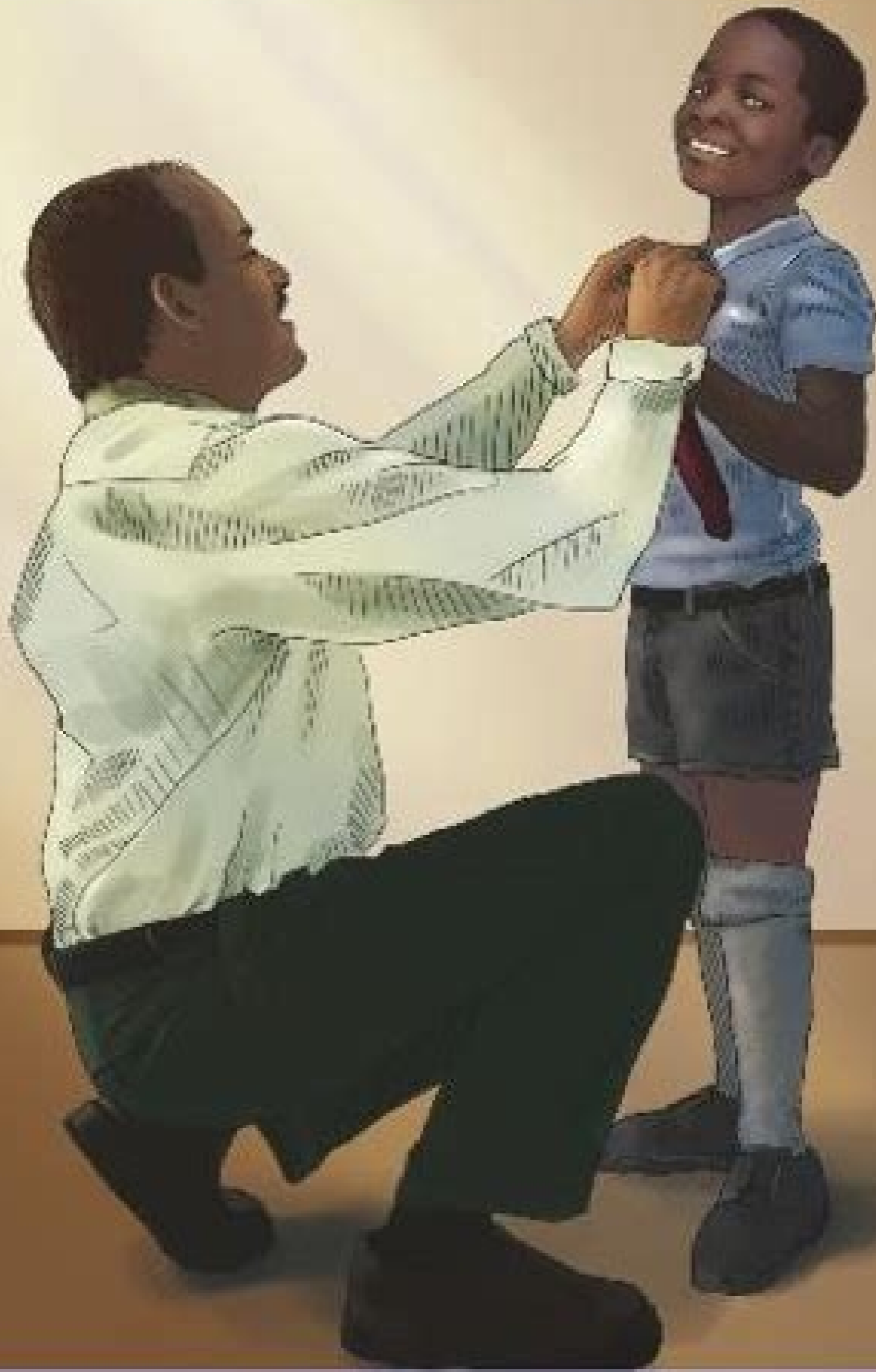
Libanga 8 • Inoveli

Oxford discover 6 workbook pdf free download. How to get oxford books for free. How to download oxford books. How to download oxford books for free.