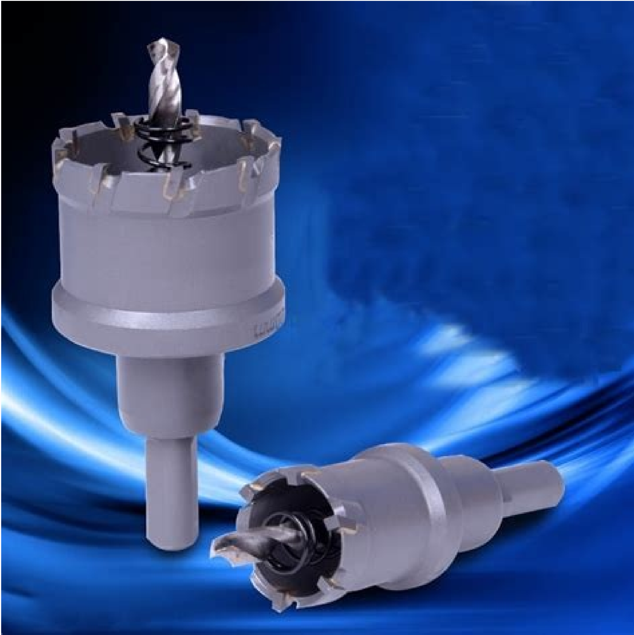
How to drill into stainless steel.